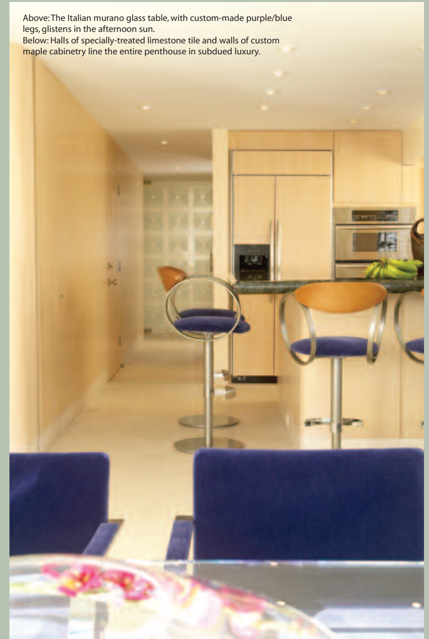
Below: Halls of specially-treated limestone tile and walls of custom maple cabinetry line the entire penthouse in subdued luxury.