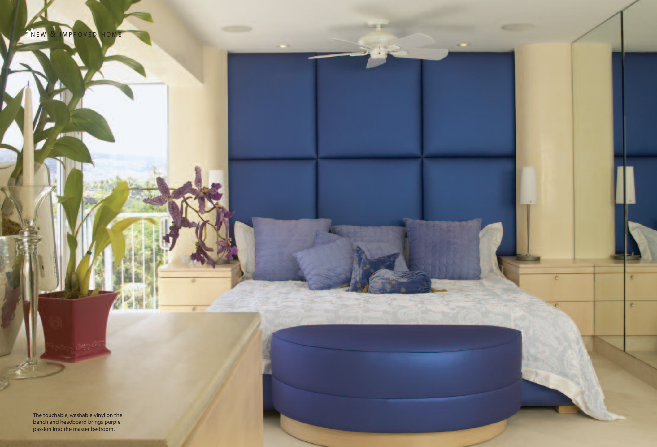
The touchable, washable vinyl on the bench and headboard brings purple passion into the master bedroom.

The master bedroom also has a punch of purple. The bed's bench and the floor-to-ceiling headboard were upholstered in Designtex purple vinyl by Romeo, of VRS Upholstery. "Vinyl has a bad wrap, Hassman explains. "When you think of vinyl, you think of nalgahide. But the design market has taken vinyl to such brilliant levels, it's now as expensive as some fine fabrics. People mistake it for satin."