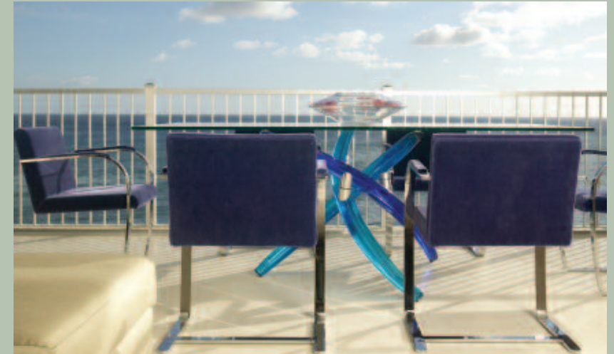
Above: The Italian murano glass table, with custom-made purple/blue legs, glistens in the afternoon sun.

The walls without cabinetry are textured with Venetian plaster. The plaster recipe is based on a mix of aged slaked lime, ground marble dust and pigment. "The plaster I ordered from Bonded Materials Co. is from Italy. The company sent me sample boards, so I could approve the color," Hassman says.